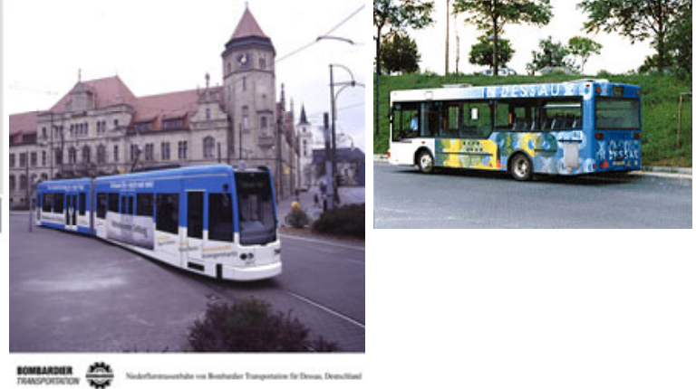
BOMBARDIER TRANSPORTATION Niederflerbusse von Bombardier Transportation für Dessau, Deutschland